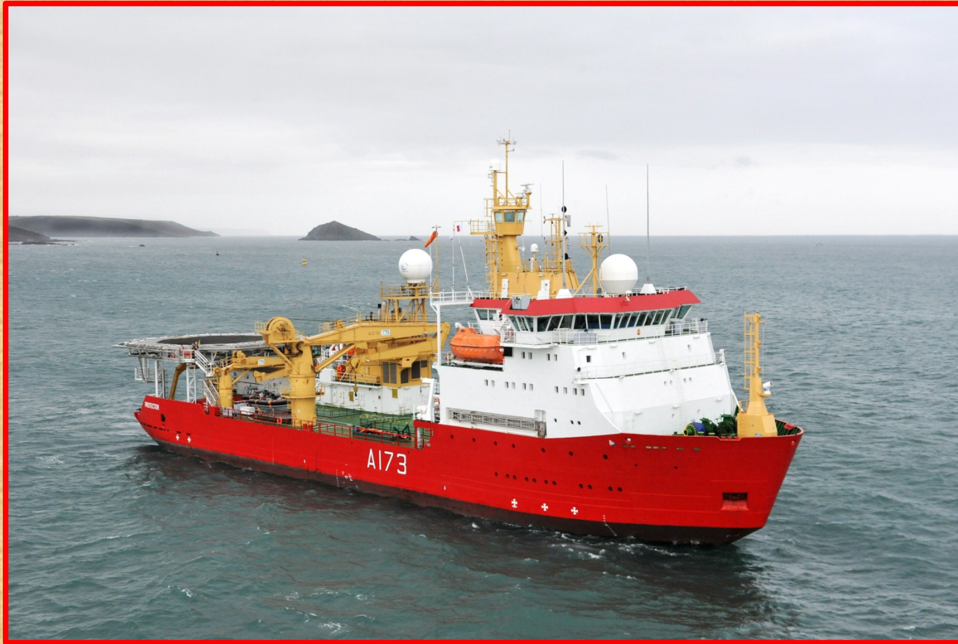
HMS Protector